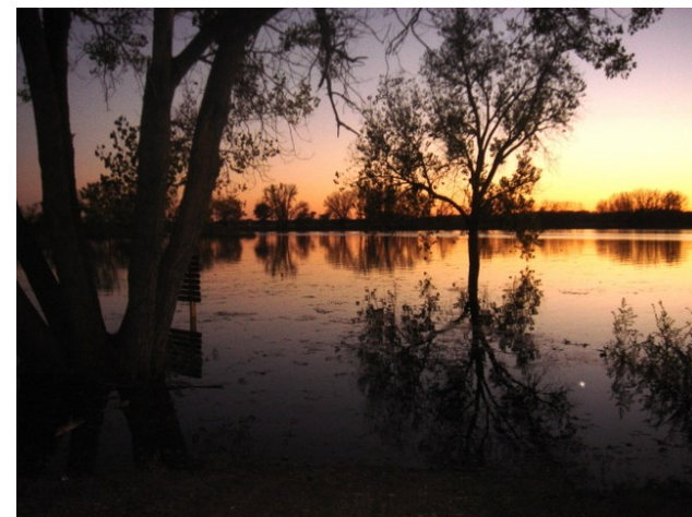
Big Sioux Recreation Area